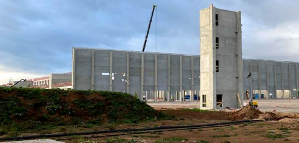
The construction of the battery gigafactory of the Chinese global market leader CATL in the industrial area "Erfurter Kreuz" in Arnstadt/Ichtershausen is progressing steadily.