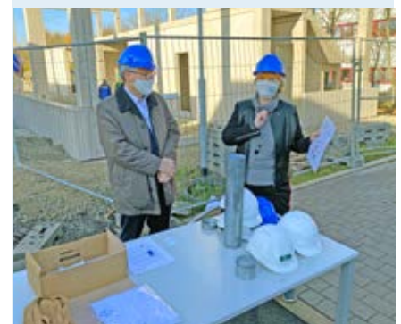
The foundation stone for the new development center is laid.

Thuringia has become a bridgehead for Antennentechnik Bad Blankenburg (ATTB) and its parent, Desay SV Automotive, to expand into Europe. ATTB will soon be operating a development center in Weimar-Legefeld where 20 to 30 highly trained experts will design solutions for smart antenna technology, electronics and software for the car of the future. ATTB plans to outfit car models with the products it develops – from smart antennas to vehicle electronics and software from Desay, its Chinese parent. ATTB used to specialize in supplying auto parts for commercial and special purpose vehicles, but the new development center marks its entry into the carmaking market. It is currently constructing the facility in close cooperation with LEG. The former factory site is thus being expanded into ATTB's future state-of-the-art research and technology campus – a place where big-name manufacturers' pre-production vehicles, a.k.a. "development mules", will drive in and out. (hw)