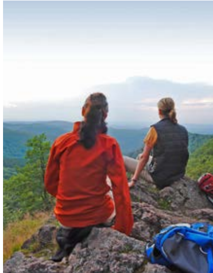
Right on trend: Hiking in Thuringia is becoming increasingly popular.

Green", being built by the Austria-based Mayer Family Hotels Group. Rennsteig fans can check in starting in 2021. (hw/gro)