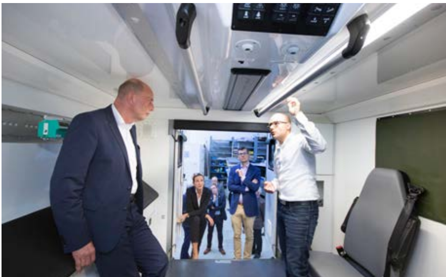
Also Thuringia's Minister for Economic Affairs, Wolfgang Tiefensee, already informed himself about the innovative UVC disinfection of BINZ.

a push of a button while the ambulance waits for its next call. It requires no warming-up period, generates no harmful ozone and has proven to be better and more variable than fluorescent bulbs, according to the Fraunhofer Institute in Ilmenau, which collaborated with BINZ in developing the innovative technology. The partnership between the company and the research institution is an example of the kind of vibrant, fruitful technology transfers that happen in Thuringia. (hw)