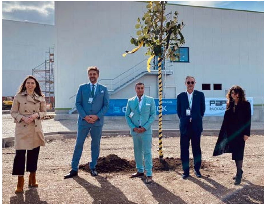
Papacks' new location should develop as well as the trees planted at the topping-out ceremony.

will be the largest production facility for molded paper fiber parts in Europe. The Thuringian factory will be a model for future plants, announced the company. Papacks already has facilities in Appingedam (NL), Cologne, Munich, Prague and Frankfurt/Main. Most of its parts are made from eco-friendly molded pulp. Sustainability is the thread running through the company’s wide product range, from transport and industrial trays to packaging for food and medical or cosmetic products to refill caps, advent calendars and much, much more. (hw/msh)