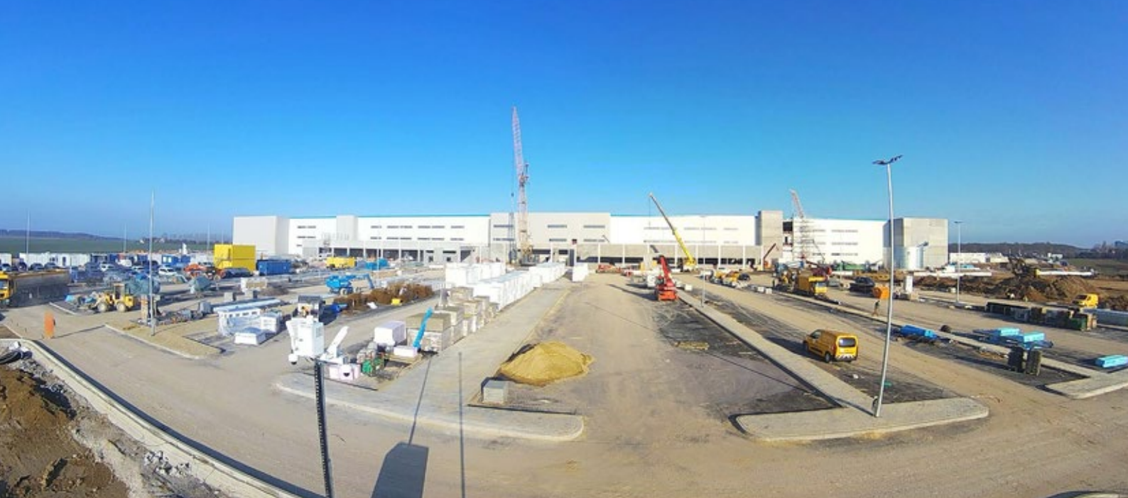
Rapid progress on the construction site of the Amazon logistics center.