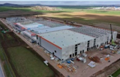
Building progress of CATL's battery factory at the industrial site "Erfurter Kreuz".

The building structure is taking shape at the large construction site belonging to Contemporary Amperex Technology Thuringia (CATT) in the Erfurter Kreuz industrial park. The Chinese battery manufacturer plans to invest EUR 1.8 billion and employ around 2,000 people at the 24-ha site. The company has irons in the fire elsewhere in Thuringia, too. CATT recently rented a bankrupt online retailer's warehouse that has stood vacant since 2019. Located in the Erfurt Freight Hub (GVZ Erfurt), the 3-ha facility will become the central European warehouse for the battery factory at Erfurter Kreuz. The project is expected to create several hundred jobs. Using an existing warehouse, which was originally constructed for EUR 45 million, will be faster than building a new facility from scratch. The batteries manufactured in Erfurter Kreuz will be shipped from the warehouse to automobile factories all over Europe. (maa)