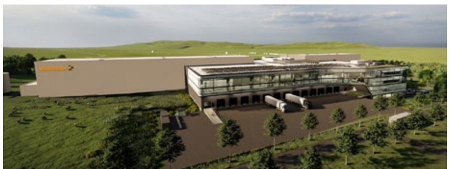
Visualization of the logistics center in the industrial area "Kindel" in Hörselberg-Hainich.

is only ten kilometers from Weidmüller's Thuringian production facility and boasts excellent access to the A4 highway and the Frankfurt and Leipzig cargo airports. Weidmüller operates other factories in Germany, Romania and the Czech Republic and intends for all the products made at these sites to be handled at the new central warehouse. The company decided to make the investment in order to keep up with fast-moving markets and optimize its supply chains. (hw)