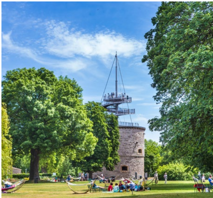
View to the observation tower in the egapark.