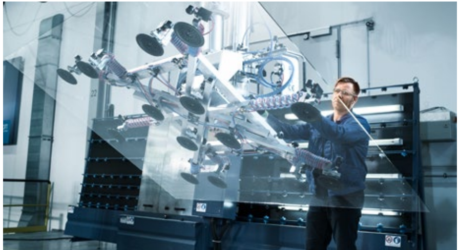
Special glass manufacturing with the microfloat unit at SCHOTT in Jena.

Business was good in large part due to the success of the cell phone cover glass that Schott produces in Jena. The tough touchscreen glass was a big seller and helped to write another chapter in the company's success story. Schott also notched up big wins producing vials for active pharmaceutical ingredients: Its customers include COVID-19 vaccine manufacturers, who have already received 80 million vials. Schott's senior management team intends to continue its company's successful trajectory in Jena with extensive investments in the future. (hw)