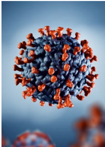
Thuringian scientists research for effective drugs to treat corona patients.

Ministry of Education and Research. Involved in this project are the Leibniz Institute for Natural Product Research and Infection Biology (Hans Knöll Institute) in Jena (project coordination), the Friedrich Schiller University in Jena and other research institutions throughout Germany. (gro)