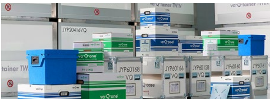
The thermal containers from va-Q-tec from Kölleda/Thuringia.

Corona vaccines arrive at the respective site in good condition, a seamless cold chain is essential. The thermo containers from va-Q-tec – produced in Thuringia – ensure any desired transport temperature between -80 °C and +25 °C thanks to the very thin insulation with vacuum insulation panels and high-tech temperature accumulators; for example, the sensitive transport of vaccine doses from Biontech and Pfizer requires temperatures as low as -80 °C – no problem for the containers from Kölleda. (gro)